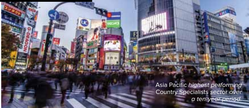
Asia Pacific highest performing Country Specialists sector over a ten-year period.