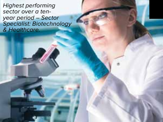
Highest performing sector over a ten-year period – Sector Specialist: Biotechnology & Healthcare.